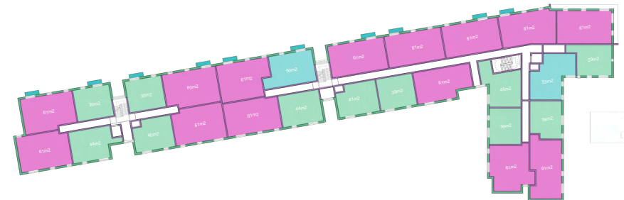
Indicative Schedule for Ground Floor