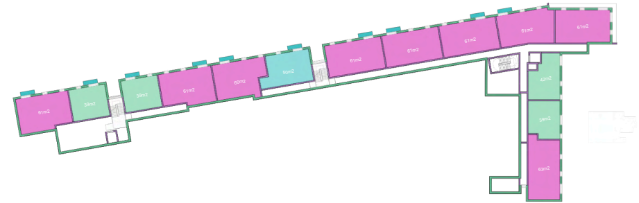
Indicative Schedule for Lower Ground Floor

We understand there is no requirement for affordable housing and no CIL is chargeable on the proposed scheme.