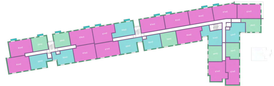
Indicative Schedule (per typical floor)

Interested parties should rely upon their own enquiries with Rugby Borough Council.