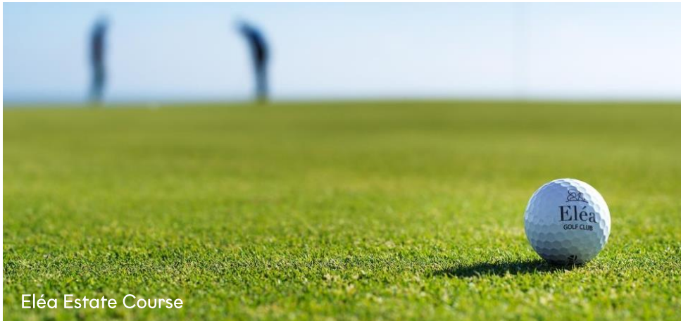
Eléa Estate Course