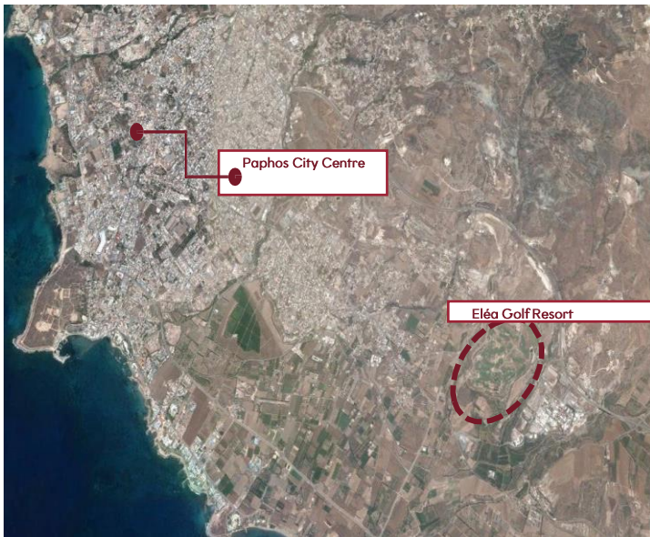
Figure 1: The Project's Location