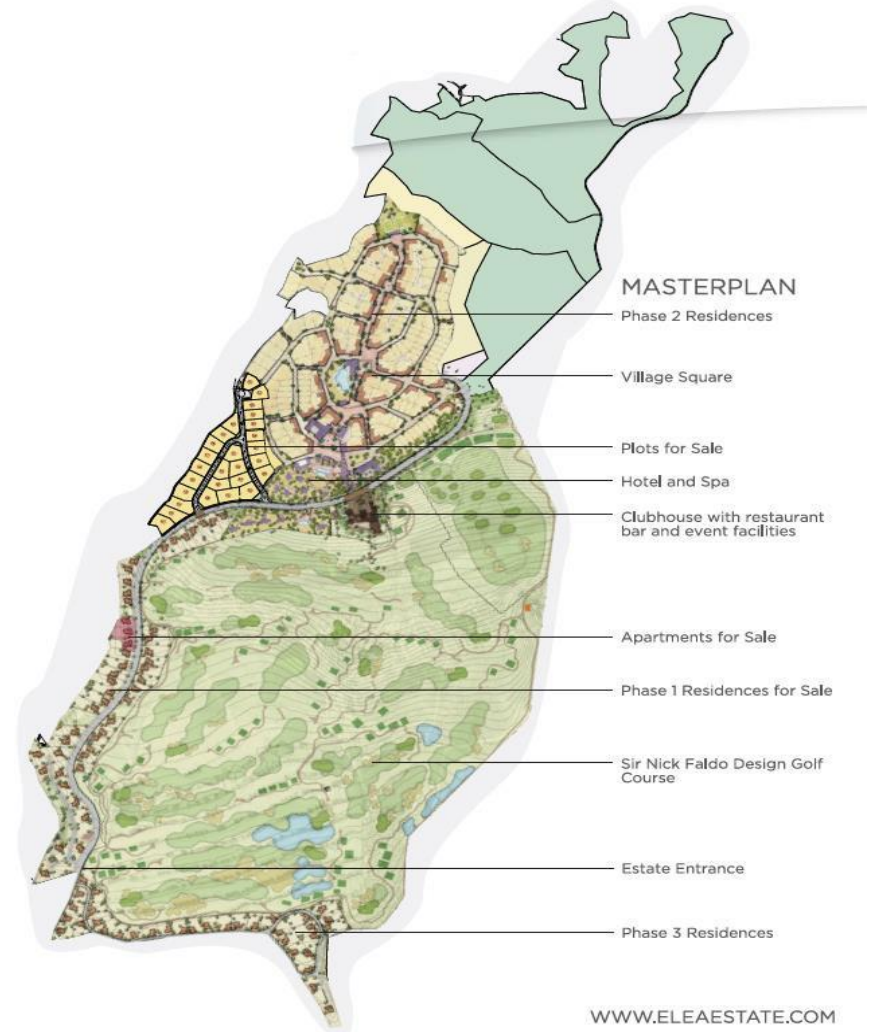
Figure 3: The Project's Masterplan