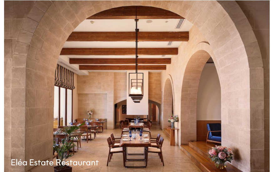
Eléa Estate Restaurant

Golf operations and F&B services are managed by an internationally acclaimed management company overseeing nearly 250 prestigious clubs worldwide, ensuring high operational standards and global marketing exposure.